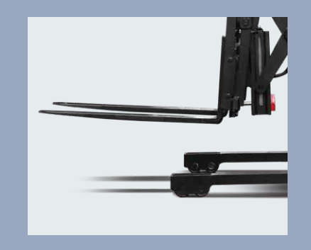
Proportional controlled forks can be operated more accurately