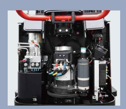
Back cover can be opened full