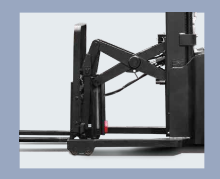
Forks move forward by the scissor